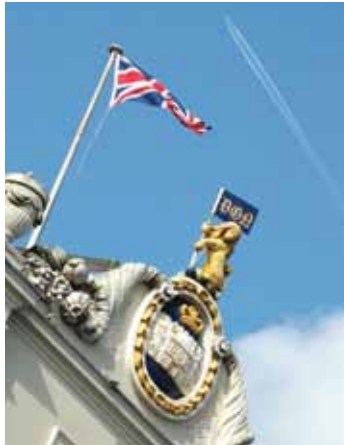
Clockwise from top: Sunny Bar gateway to town centre; Doncaster Racecourse; Mansion House; Floral display of St George and the Dragon in front of the Minster

Whether you are here on business and have a few hours spare, or have decided to come and explore for a short break, or maybe even longer, we hope we can inspire you to let us give you a warm welcome to Doncaster very soon.